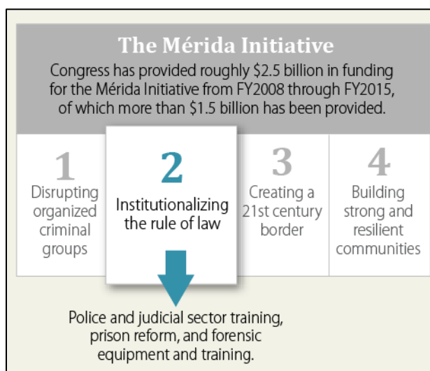
Figure 1. Current Status and Focus of the Mérida Initiative

Congress has played a major role in determining the level and composition of Mérida Initiative funding for Mexico. From FY2008 to FY2015, Congress appropriated nearly $2.5 billion for Mexico under the Mérida Initiative (see Table 1 for Mérida appropriations and Table A-1 in Appendix for overall U.S. assistance to Mexico since FY2010). In the beginning, Congress included funding for Mexico in supplemental appropriations measures in an attempt to hasten the delivery of certain equipment. Congress has also earmarked funds in order to ensure that certain programs are prioritized, such as efforts to support institutional reform. From FY2012 onward, funds provided for pillar two have exceeded all other aid categories. In FY2015, Congress provided $28.6 million above the Administration's request, with additional funding for justice sector programs and efforts to help secure Mexico's southern border.