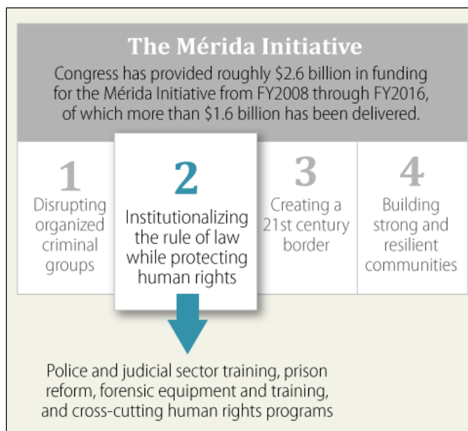
Figure 3. Four Pillars of the Mérida Initiative

Source: U.S. Department of State, “Fact Sheet: the Mérida Initiative: an Overview,” January 15, 2015; Graphic prepared by CRS Graphics.