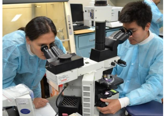
The U.S. Naval Medical Research Unit 6, located in Lima, Peru, prevents, detects and responds to disease outbreaks, in particular, mosquito-borne illness to include Zika, dengue fever and chikungunya.

Regionally, our health and medical readiness engagements build partner nation capacity—including infrastructure, equipment, and skilled personnel—to prevent, detect, and respond to disease outbreaks. At the early stages of the Zika outbreak, the U.S. Naval Medical Research Unit 6 (NAMRU-6), based in Peru, established research sites in partnership with Colombia, Guatemala, Honduras,