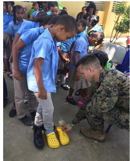
USSOUTHCOM coordinated the donation of 600 pairs of shoes from the Shuzz Fund during the 2016 NEW HORIZONS exercise.

Led by U.S. Army South and U.S. Air Forces Southern/12 th Air Force, our BEYOND THE HORIZON and NEW HORIZONS humanitarian and civic assistance exercises incorporated more than 2,000 U.S., partner nation, and public/private participants from seven nations. This network treated nearly 30,000 patients, conducted 242 surgeries, and constructed schools and clinics in remote areas. Similarly, our training missions like JTF-Bravo's medical engagements and CONTINUING PROMISE bring together U.S. military personnel, partner nation forces and civilian volunteers to treat tens of thousands of the region's citizens. We are also building basic infrastructure like schools, medical clinics, and emergency operations centers and warehouses for relief supplies. These activities provide training opportunities for our own personnel, while also improving the ability of our partners to provide essential services to their citizens and meet