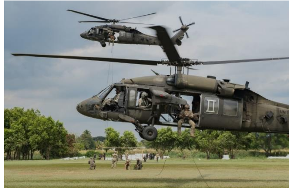
A pair of UH-60 Blackhawk helicopters assigned to Joint Task Force-Bravo's 1st Battalion 228th Aviation Regiment provide aviation support during Operation Serpiente, a joint air assault training mission led by members of the U.S. 7th Special Forces Group and Naval Special Warfare, Dec. 2, 2016 at Ilopango Airport, El Salvador.

while ensuring the layered defense of the U.S. homeland. Central American partners are increasingly capable, playing a significant role in almost a quarter of JIATF South's maritime interdiction operations and conducting operations on their own, and with one another.