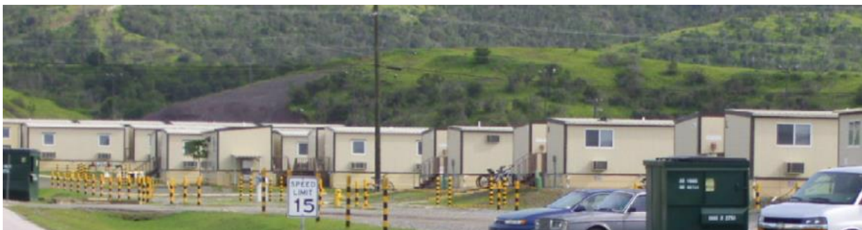
An estimated 580 troops live in containerized housing units manufactured in 2006 and 2008. All units have exceeded their economic life of five to seven years. Common problems with the units are roof leaks, plumbing failures and mold growth.

Our no-fail mission: detention operations. Although most of our efforts are focused on engaging with our partners in Latin America, we also continue the safe, humane, legal, and transparent care and custody of the remaining detainees at JTF-GTMO. As many members of Congress have witnessed firsthand, the medical and guard force at JTF-GTMO are not merely caring for these detainees; they are providing the best of care . Our troops in close contact with detainees face periodic assaults and threats to them and their families, yet they remain steadfast in their principled care and custody role. Every day they demonstrate the same discipline, professionalism, and integrity as they confront the same dangerous adversaries as our men and women fighting in Afghanistan, Iraq, and elsewhere around the world. I know this Committee, our Secretary of Defense, and our President applaud their commitment and share my pride in