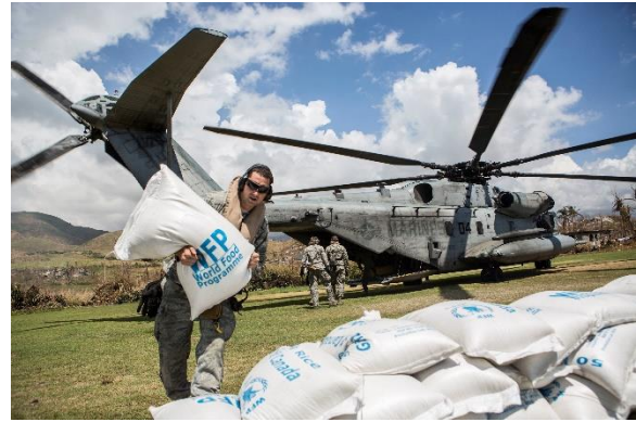
U.S. service members from Joint Task Force Matthew offload bags of food from the World Food Programme onto a pallet in preparation for delivery to the areas affected by Hurricane Matthew in Port-au-Prince, Haiti, Oct. 12, 2016. By the end of their mission, Joint Task Force Matthew delivered 275 metric tons of supplies and conducted 98 missions in support of USAID/OFDA and the Government of Haiti.

Additionally, the immediate deployment of elements from U.S. Transportation Command's (USTRANSCOM) Joint Enabling Capabilities Command (JECC) was absolutely critical to our effective response. U.S.-based forces deployed aboard the USS MESA VERDE and USS IWO JIMA also provided robust relief from the sea. During the relief mission, we also coordinated with our U.S. Coast Guard (USCG) partners to deter potential migration in the aftermath of the hurricane and supported the