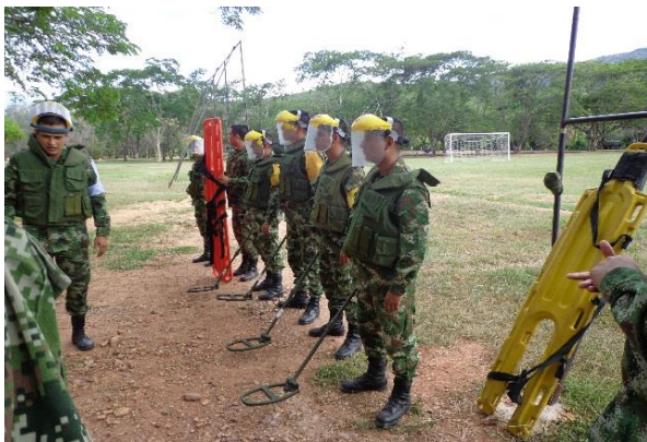
A Colombian demining team conducting demining drills.

In Colombia, the 52-year conflict has also left the country among the world's most heavily contaminated by landmines, improvised explosive devices (IED), and unexploded ordnance (UXO), which affect 31 of Colombia's 32 departments. As part of an interagency effort, USSOUTHCOM's Humanitarian Mine Action program provides 'train-the-trainer' courses to