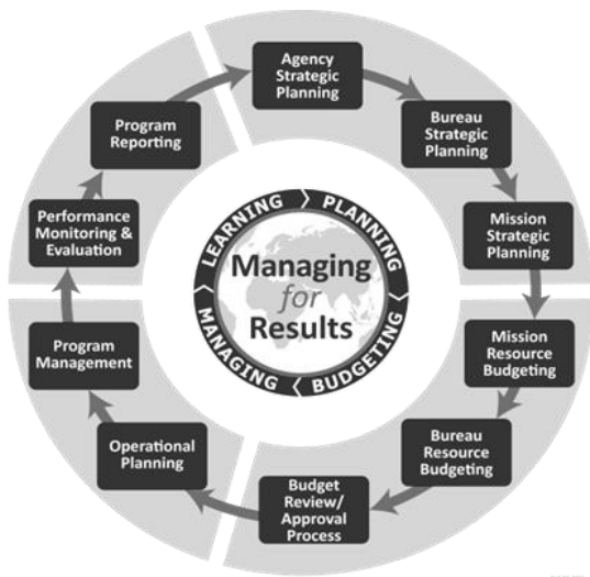
State Department Performance Framework

The Department of State and USAID's approaches to the annual planning, budgeting and performance management cycle create feedback loops between strategic planning, budgeting, program management, monitoring, evaluation and learning that maximize the impact of Department and USAID resources.