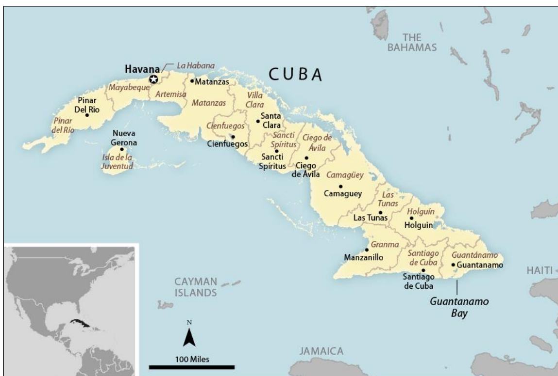
Figure 1. Provincial Map of Cuba

Since 2019, the Trump Administration has significantly expanded U.S. economic sanctions on Cuba by reimposing many restrictions eased under the Obama Administration and imposing a series of strong sanctions designed to pressure the government on its human rights record and for its support for the Nicolás Maduro government in Venezuela. These actions have included allowing lawsuits against those trafficking in property confiscated by the Cuban government, tightening restrictions on U.S. travel and remittances to Cuba, and engaging in efforts to stop Venezuelan oil exports to Cuba.