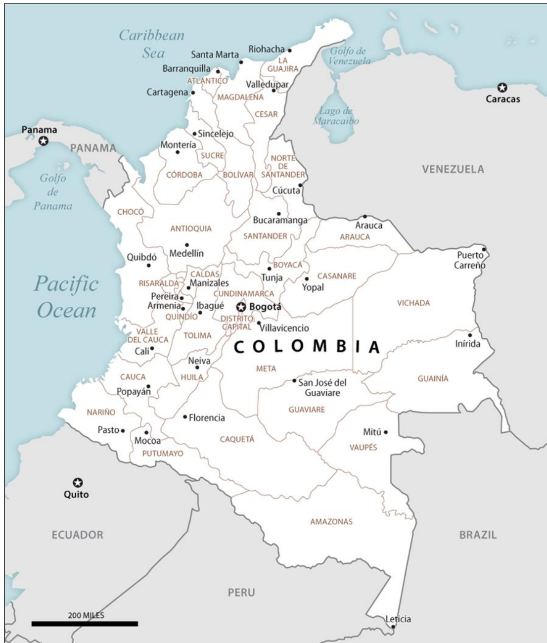
Figure I. Map of Colombia (departments and capitals shown)