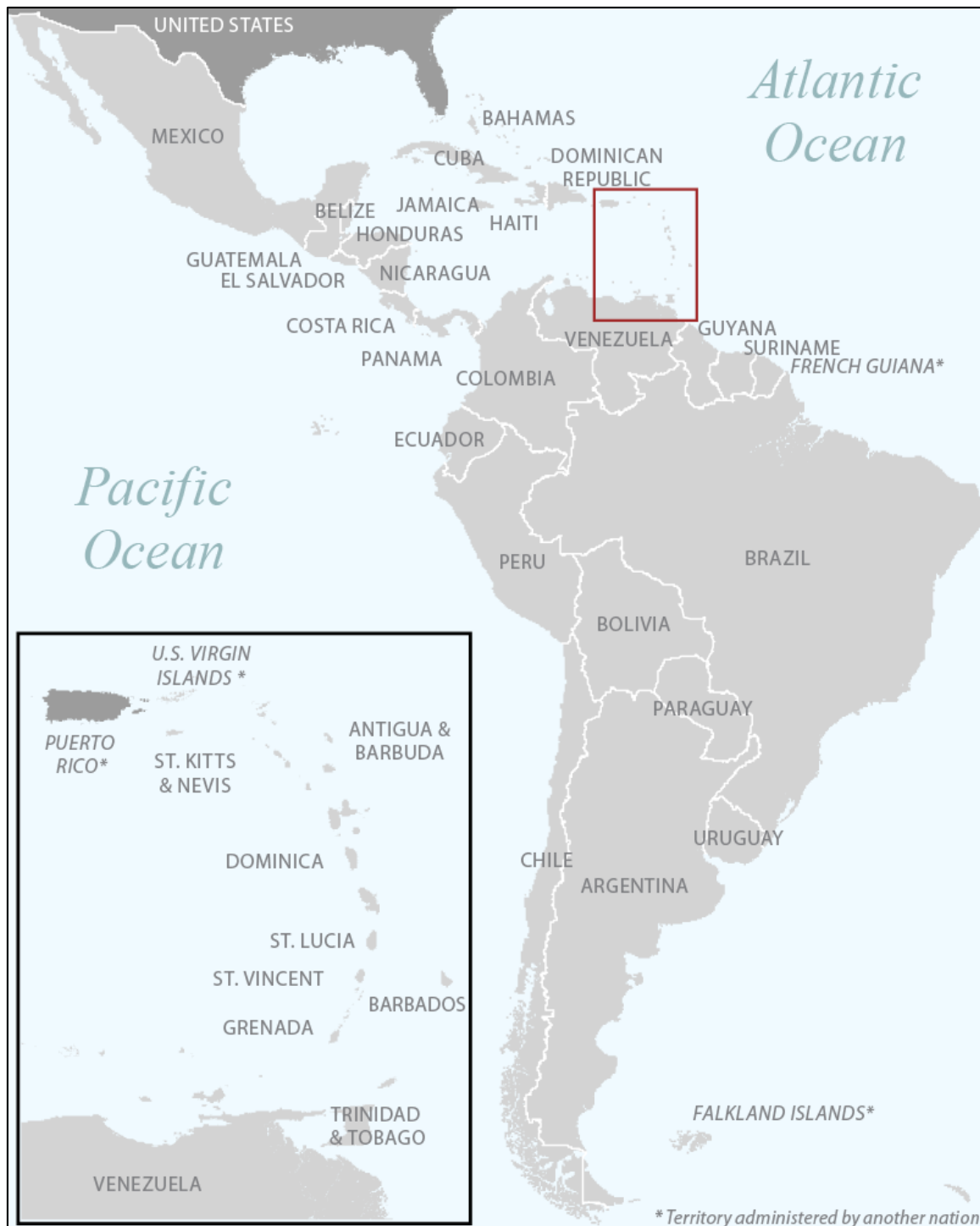
Figure I. Map of Latin America and the Caribbean