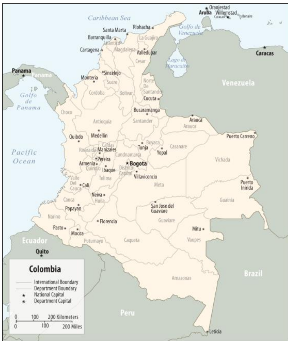
Figure I. Map of Colombia Showing Departments and Capital