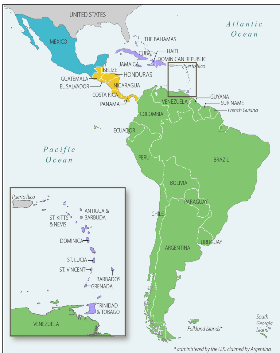
Figure 1. Map of Latin America and the Caribbean