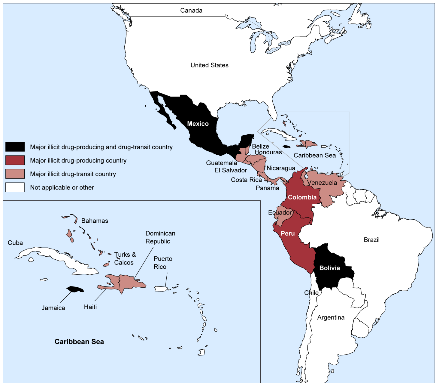
Figure 1: Map of Major Drug-Producing and Drug-Transit Countries in the Western Hemisphere

Source: Department of State's Bureau for International Narcotics and Law Enforcement Affairs, International Narcotics Control Strategy Report , Volume 1, Drug and Chemical Control, (March 2017). | GAO-18-10